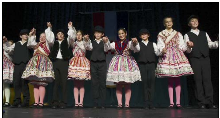
SJTs at CroatiaFest 2006.