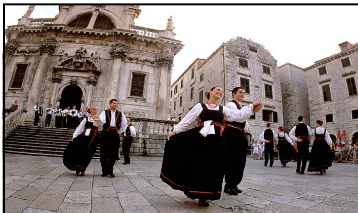
Vela Luka in Dubrovnik, Croatia, 2000.

August 1-3: Anacortes, WA VL Fundraiser during Anacortes Arts Festival Croatian Cultural Center