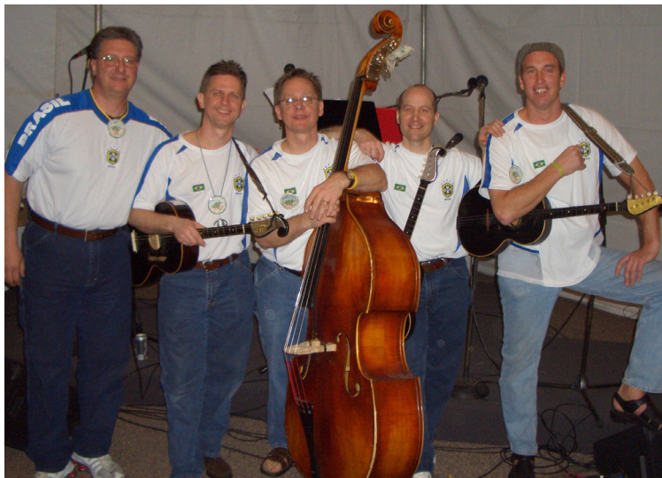
Tamburaški Sastav Ponoć (top) and Sinovi Orchestra (bottom) will perform at CroatiaFest.

Each group has a unique style and repertoire. Both bands will perform at the Saturday night kick off dance and sing-along at the Russian Community Center on Oct. 6. Doors open at 6 p.m. Admission is just $10 at the door. A la carte dinner will be prepared by the Seattle Jr. Tamburitzan