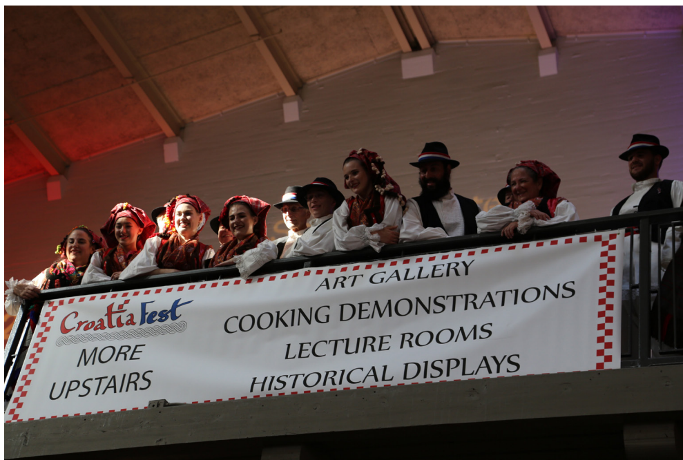
Radost Folk Ensemble watches a performance at CroatiaFest 2017.