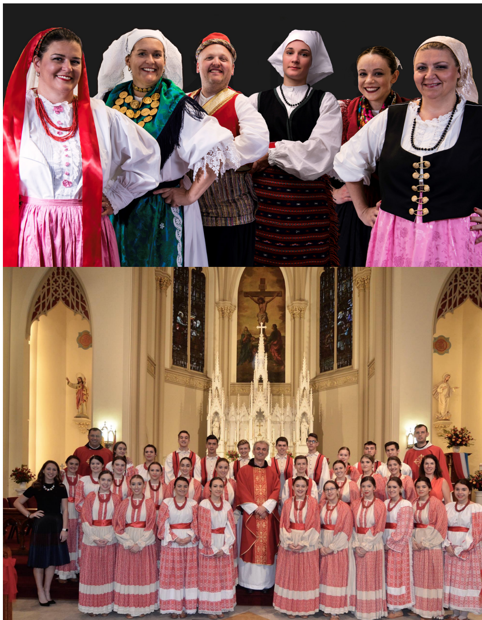
Top: Vokalna Skupina Korijeni. Bottom: Kardinal Stepinac New York.

As Croatians began to build their lives in this foreign country, for many it was a hardship. The Croatian church was the place that all Croatians could come to spend time together to reconnect to their roots by sharing their stories from the homeland. Sts. Cyril & Methodious & St. Rafael Croatian Church was the center for all Croatians to come together to pray, sing, dance, and preserve their rich culture, heritage and language. These Croatians wanted to ensure that their deep-rooted traditions were passed on to their children to ensure they never forget their roots