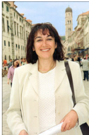
Dubravka Šuica, Mayor of Dubrovnik