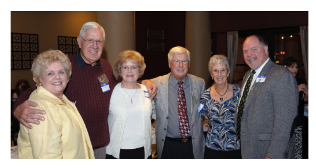
Clockwise from top right: Seattle Jr. Tamburitizans. A group of attendees admires the main stage entertainment. Group from Aberdeen, Wash. Tamburaski Orkestar Kardinal Stepinac. A young Croatian-American girl. Klapa Doo Wopella.