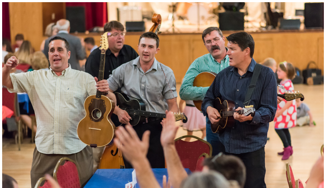
Partying with Sinovi.